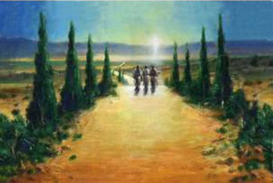
“The Road Back”

We will continue to live-stream our Sunday 8:00 am and 10:45 am Services and Mondays at 6:30 pm. Other services may also be live-streamed. They will also be recorded on our website to be watched at any time.